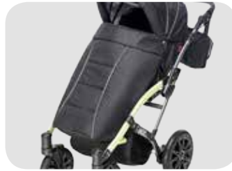
Warm cover works great during bad weather conditions.