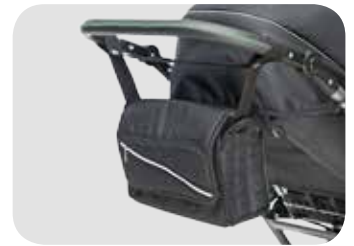
Stylish and capacious bag can store many useful little things.