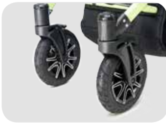
Front swivel wheels with directional lock facilitate easy maneuvering of the stroller.

We offer 24 months warranty on the product. We also provide after sales service.